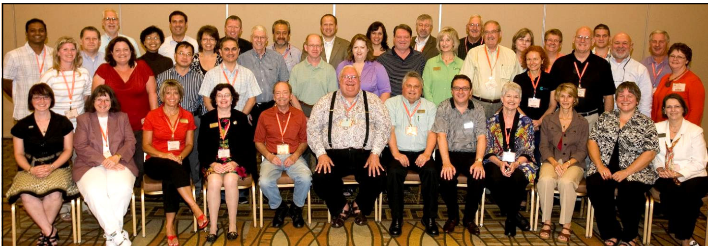
IAFP Affiliate Council meeting, August 2010