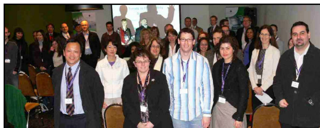
AAFFP meeting attendees in Melbourne.

The Australian Association for Food Protection held its third annual general meeting (AGM) in Melbourne during the Australian Institute of Food Science and Technology (AIFST) Convention, July 27–29. The joint seminar, “Protecting the Integrity of the Australian Food Supply Chain,” attracted an audience of approximately 60 attendees and covered a range of integrity issues, from terrorism and pandemic influenza to managing supply chain disruption.